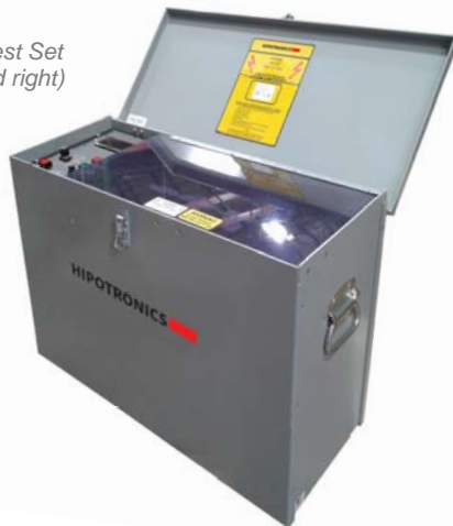
90kV Test Set (pictured right)

This series is designed to meet testing specifications from all parts of the world with test cells available for ASTM D877, and ASTM D1816 testing standards. Each unit also includes three pre-programmed rates of voltage rise and automatic termination of high voltage upon sample breakdown. A digital memory kilovoltmeter automatically records the breakdown voltage for each test sample. A 60kV AC model, OC60-DI, is available with digital interface controls.